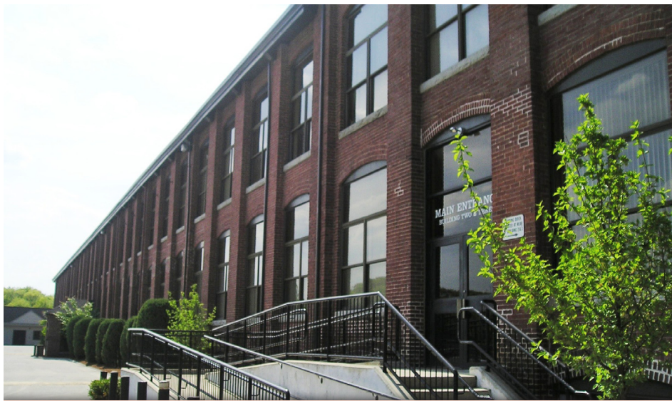
Floor plans and additional photos available online.